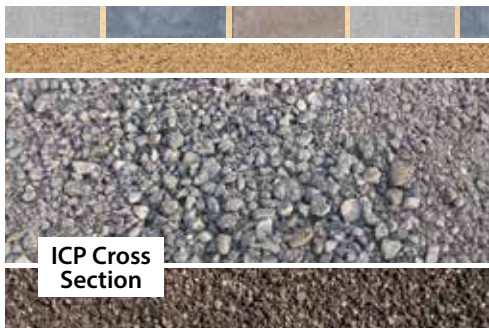
Edge restraint detail provided based on application.